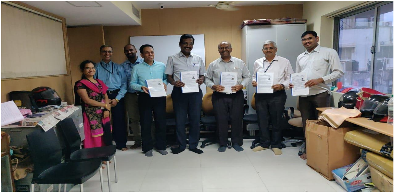
PARTICIPATION BY SWASA MEMBERS PHOTOGRAPH ::: FEBRUARY 2019